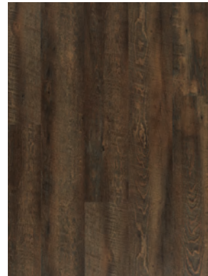
CINNAMON Dryback 60001380 | Click 60001579