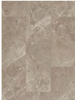
CLIFF Dryback 60001881 | Click 60001876