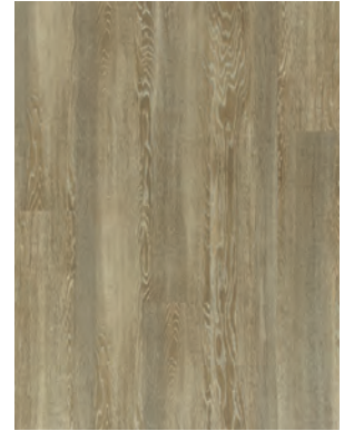
GINGER Dryback 60001381 | Click 60001580