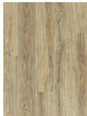
BARLEY Dryback 60001378 | Click 60001577