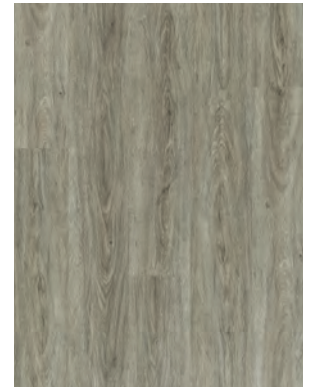
ASH Dryback 60001376 | Click 60001575