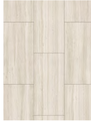
SANDSTONE Dryback 60001882 | Click 60001877