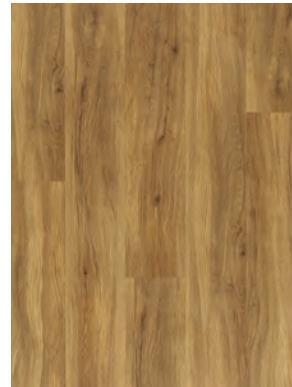
GUNSTOCK Dryback 60001382 | Click 60001581