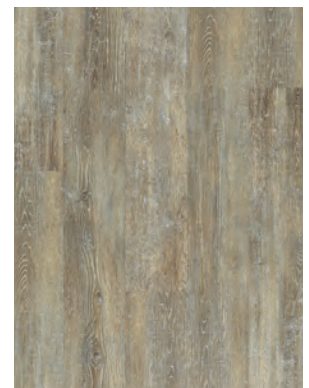
SAND Dryback 60001383 | Click 60001582