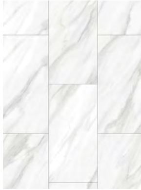
ARCTIC Dryback 60001883 | Click 60001878