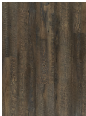
BARK Dryback 60001377 | Click 60001576