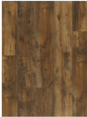
CHESTNUT Dryback 60001379 | Click 60001578